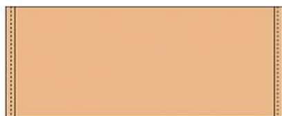
Fold sides and sew.